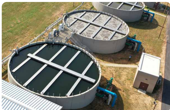
Three AquaNereda® reactors show compact design, typically 50% of a conventional plant.