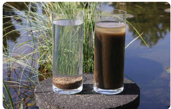
SVI 5 comparison of aerobic granular sludge (left) and conventional activated sludge (right)