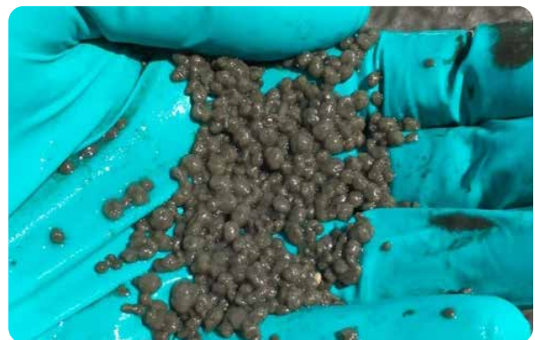
Granule sample following sieve testing at the AquaNereda® demonstration facility, Rockford, IL